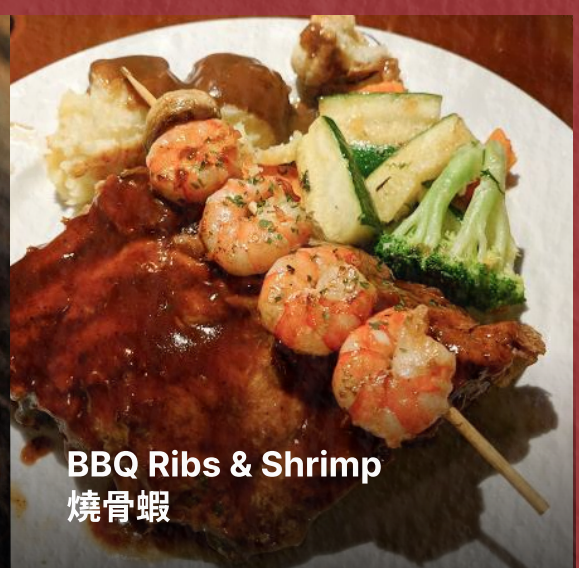
BBQ Ribs & Shrimp 燒骨蝦