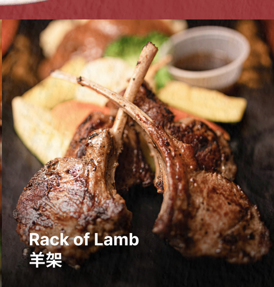
Rack of Lamb 羊架