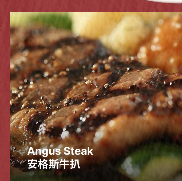
Angus Steak 安格斯牛扒