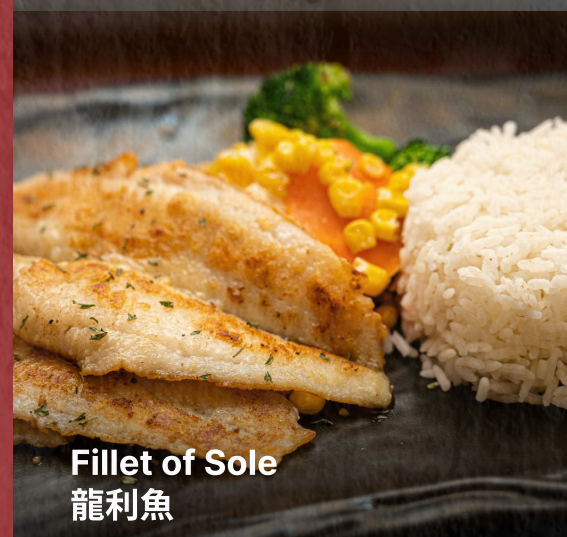
Fillet of Sole 龍利魚