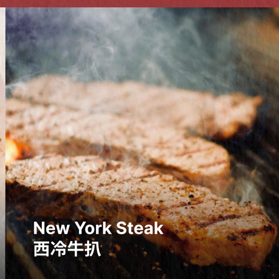
New York Steak 西冷牛扒