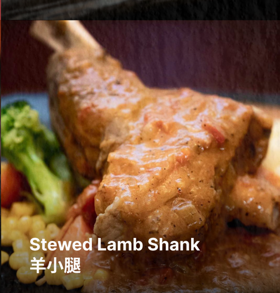
Stewed Lamb Shank 羊小腿