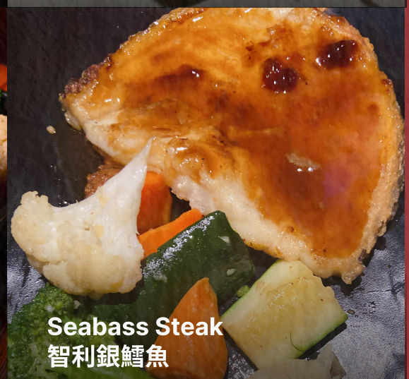
Seabass Steak 智利銀鱈魚