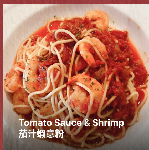
Tomato Sauce & Shrimp 茄汁蝦意粉