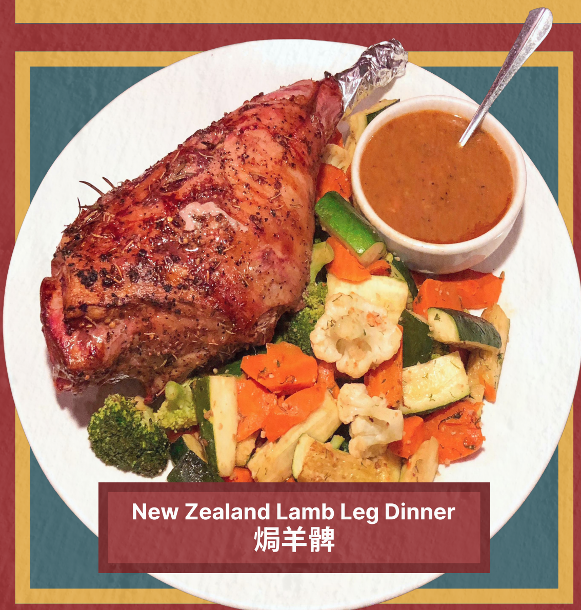
New Zealand Lamb Leg Dinner 焗羊髀