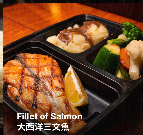
Fillet of Salmon 大西洋三文魚