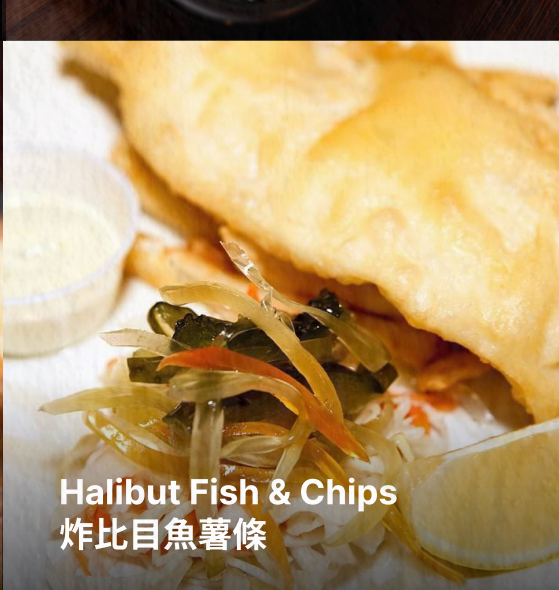
Halibut Fish & Chips 炸比目魚薯條