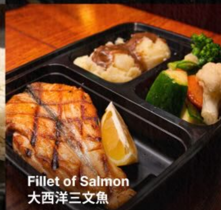
Fillet of Salmon 大西洋三文魚