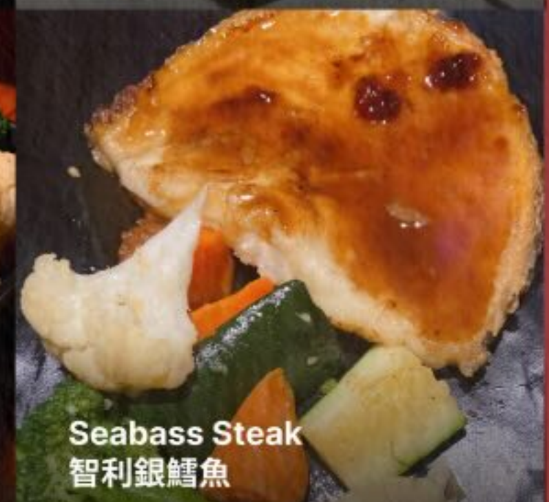
Seabass Steak 智利銀鱈魚