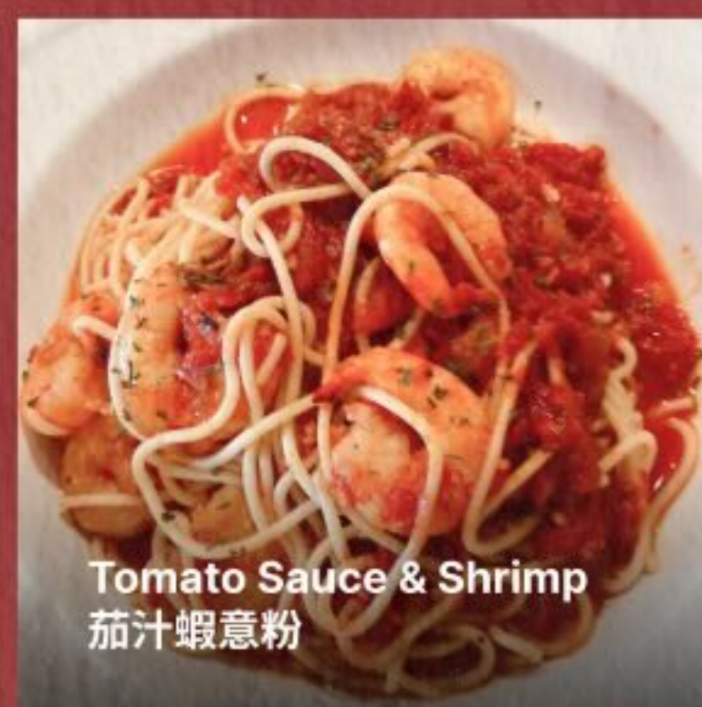
Tomato Sauce & Shrimp 茄汁蝦意粉