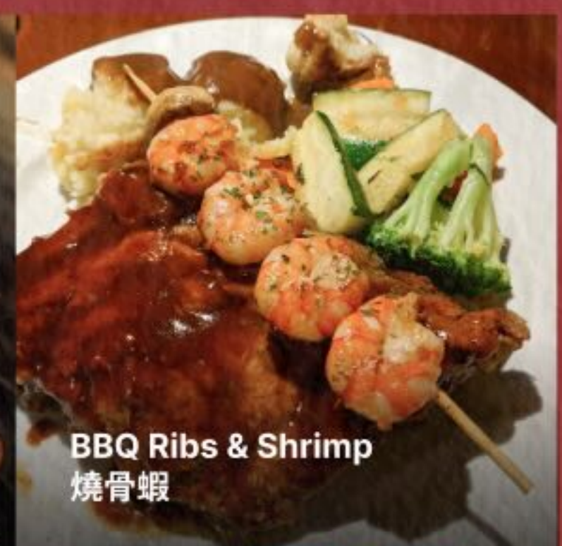
BBQ Ribs & Shrimp 燒骨蝦