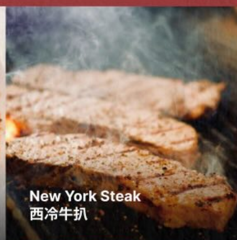
New York Steak 西冷牛扒