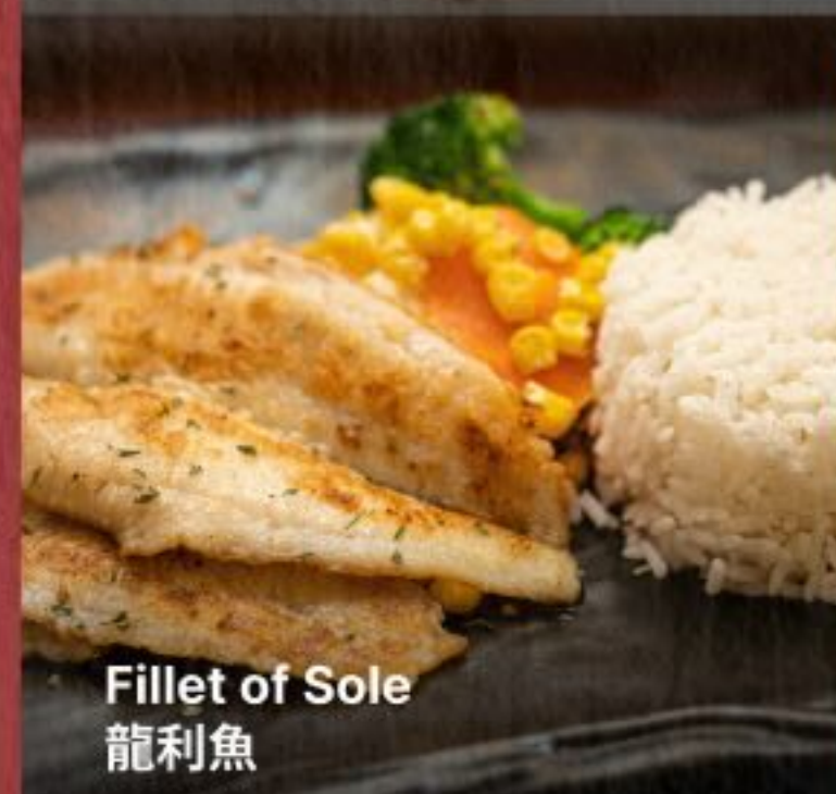
Fillet of Sole 龍利魚