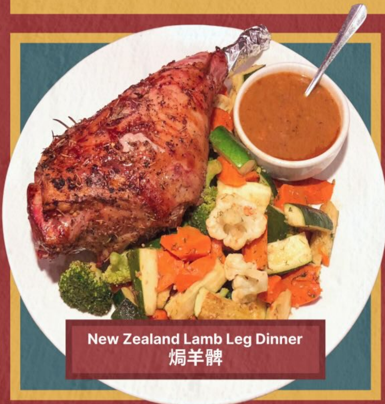
New Zealand Lamb Leg Dinner 焗羊髀