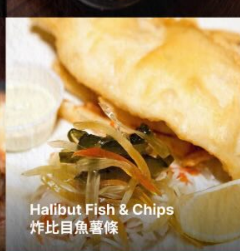
Halibut Fish & Chips 炸比目魚薯條