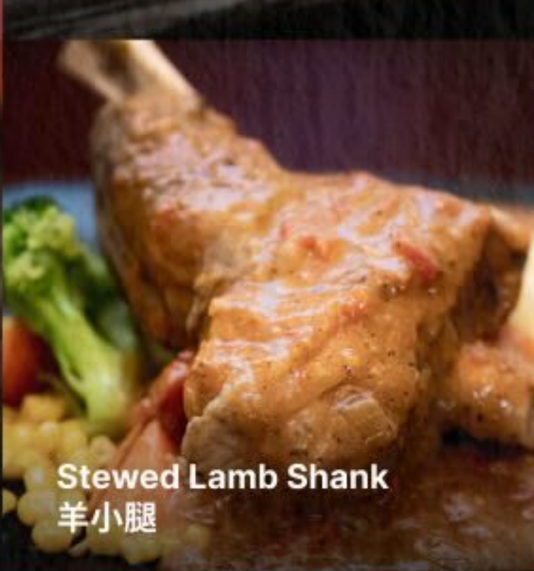
Stewed Lamb Shank 羊小腿