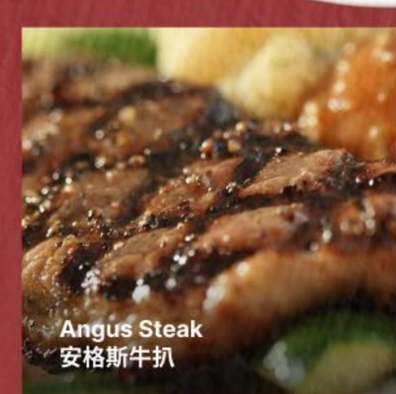
Angus Steak 安格斯牛扒