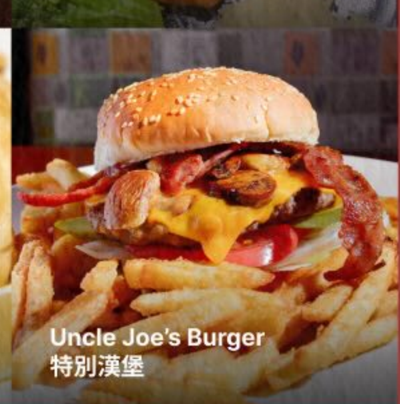
Uncle Joe's Burger 特別漢堡