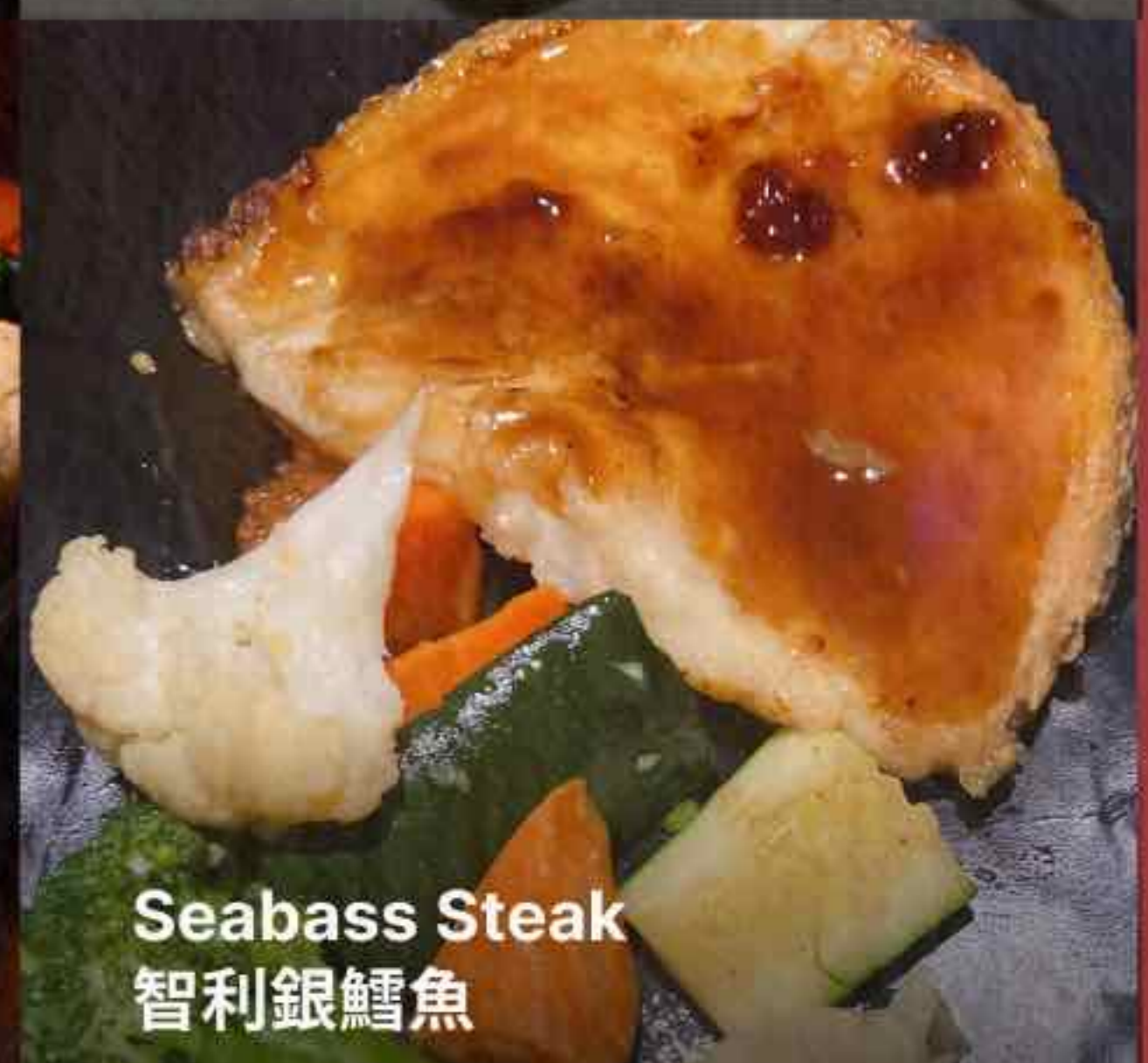
Seabass Steak 智利銀鱈魚