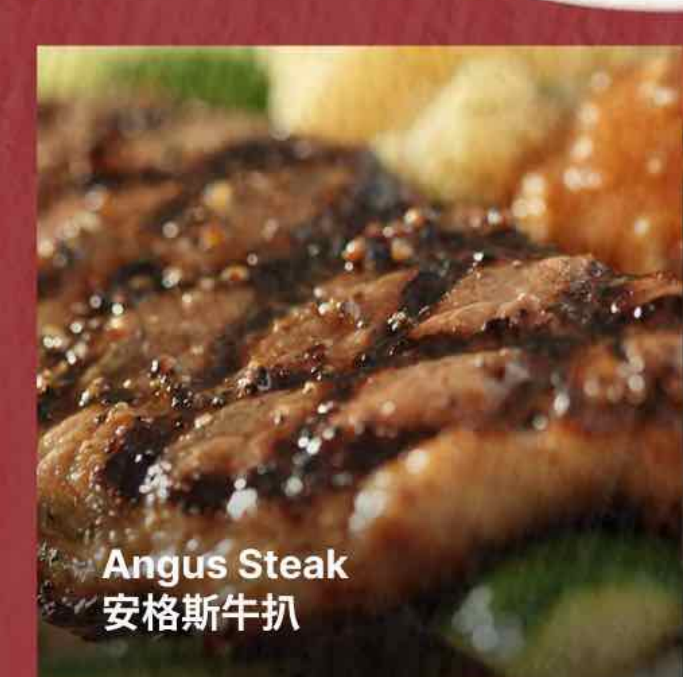
Angus Steak 安格斯牛扒