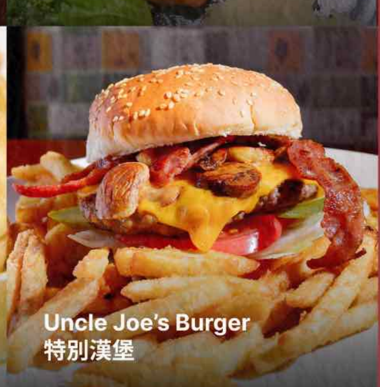
Uncle Joe's Burger 特別漢堡