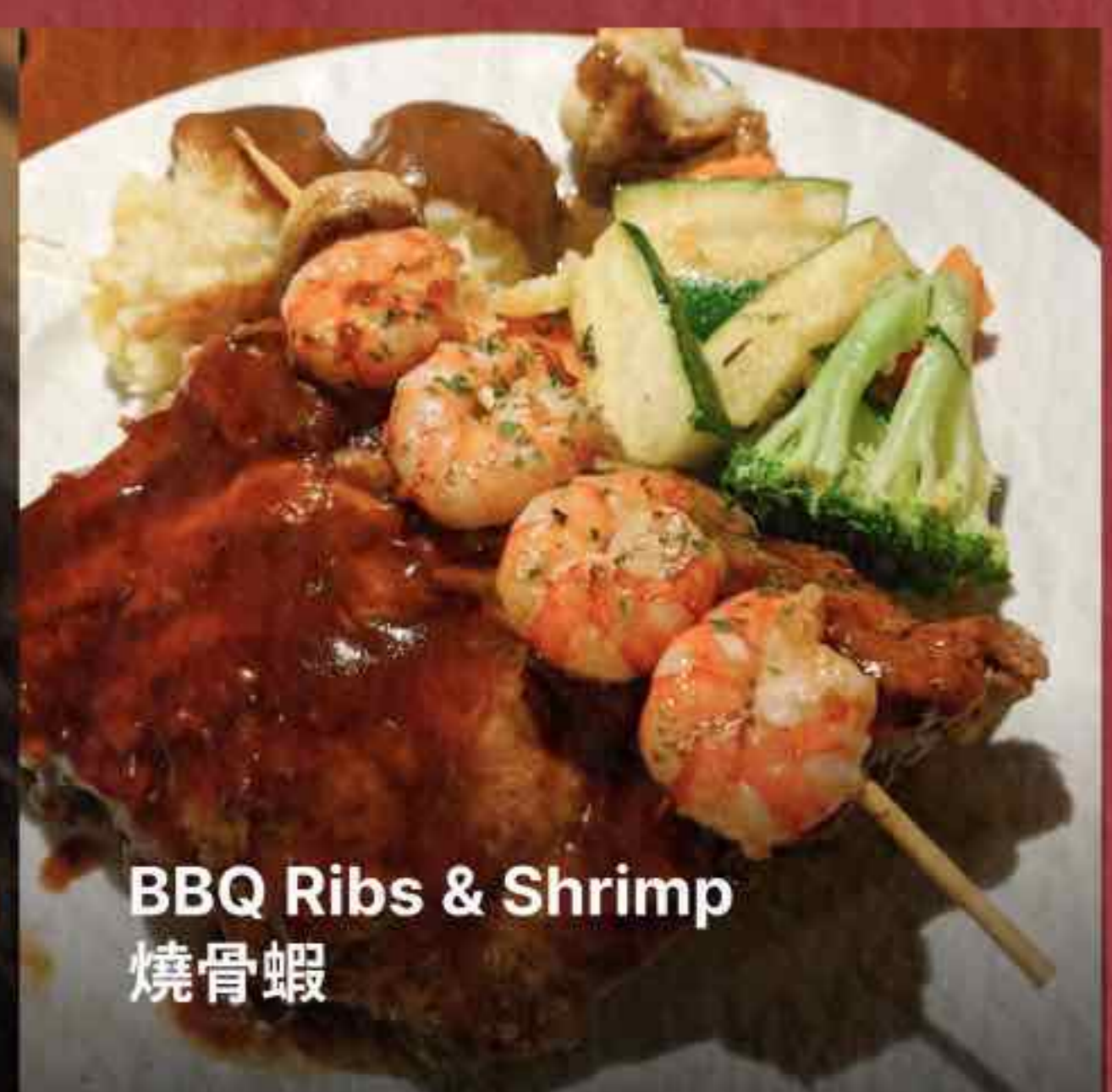
BBQ Ribs & Shrimp 燒骨蝦