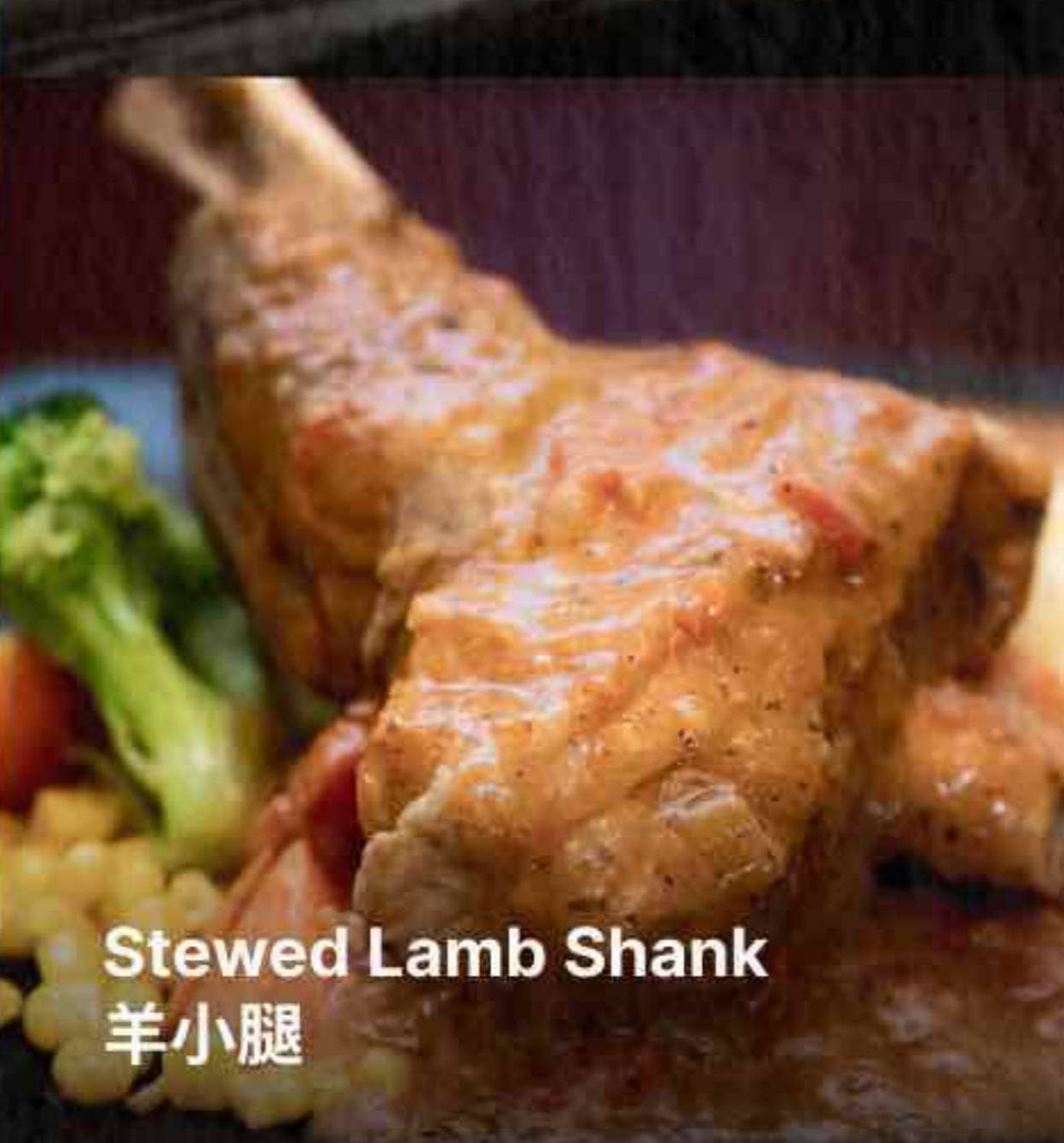
Stewed Lamb Shank 羊小腿