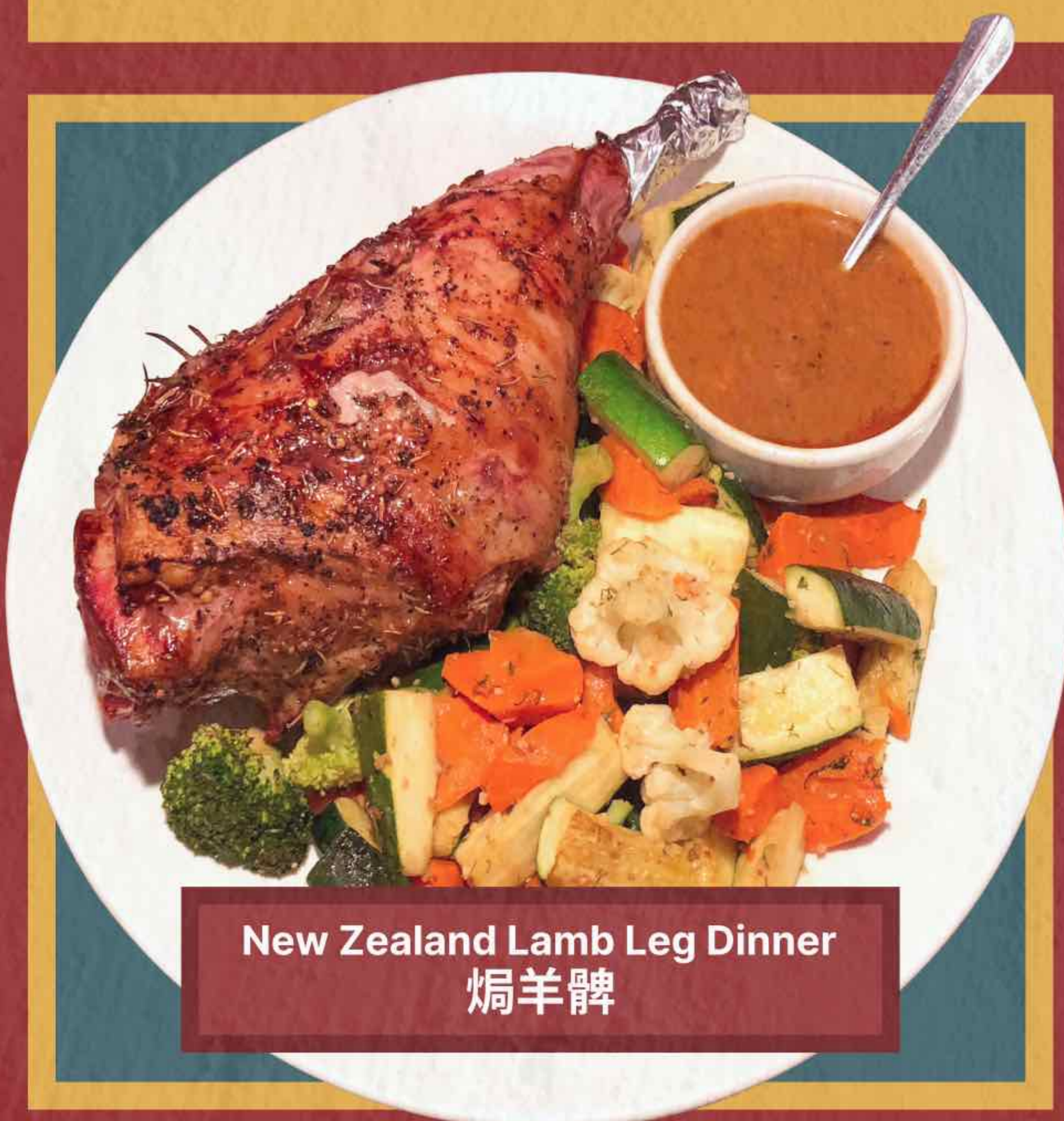
New Zealand Lamb Leg Dinner 焗羊髀