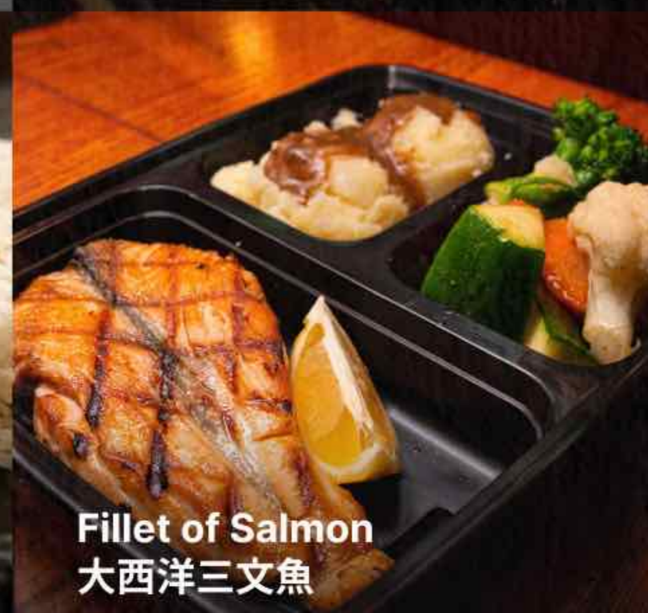
Fillet of Salmon 大西洋三文魚