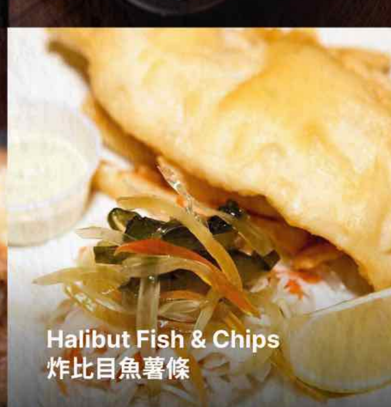
Halibut Fish & Chips 炸比目魚薯條