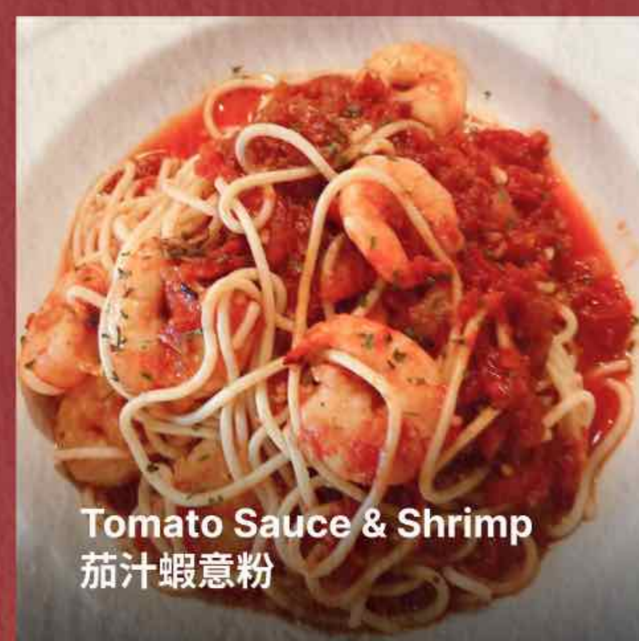
Tomato Sauce & Shrimp 茄汁蝦意粉