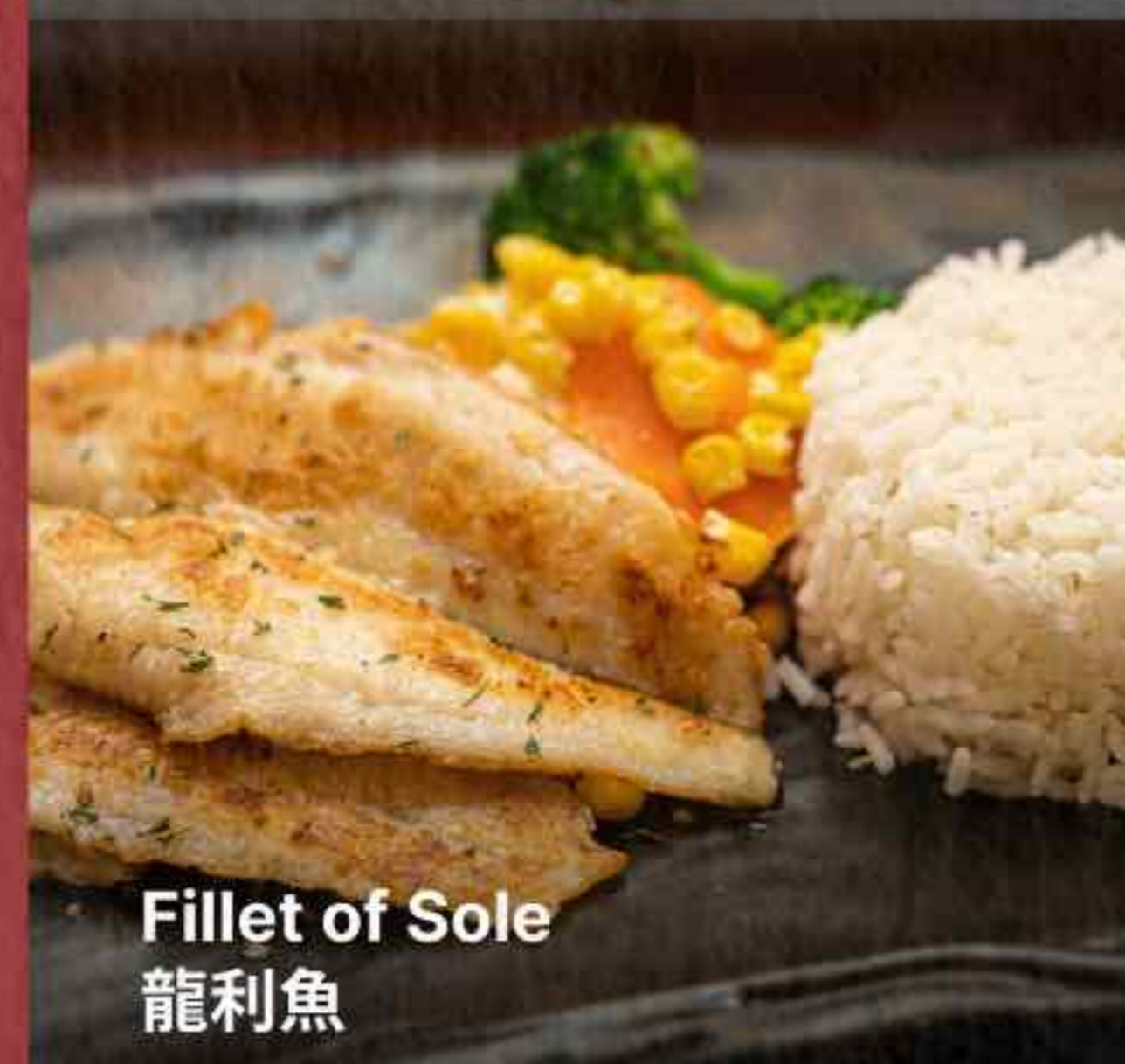
Fillet of Sole 龍利魚