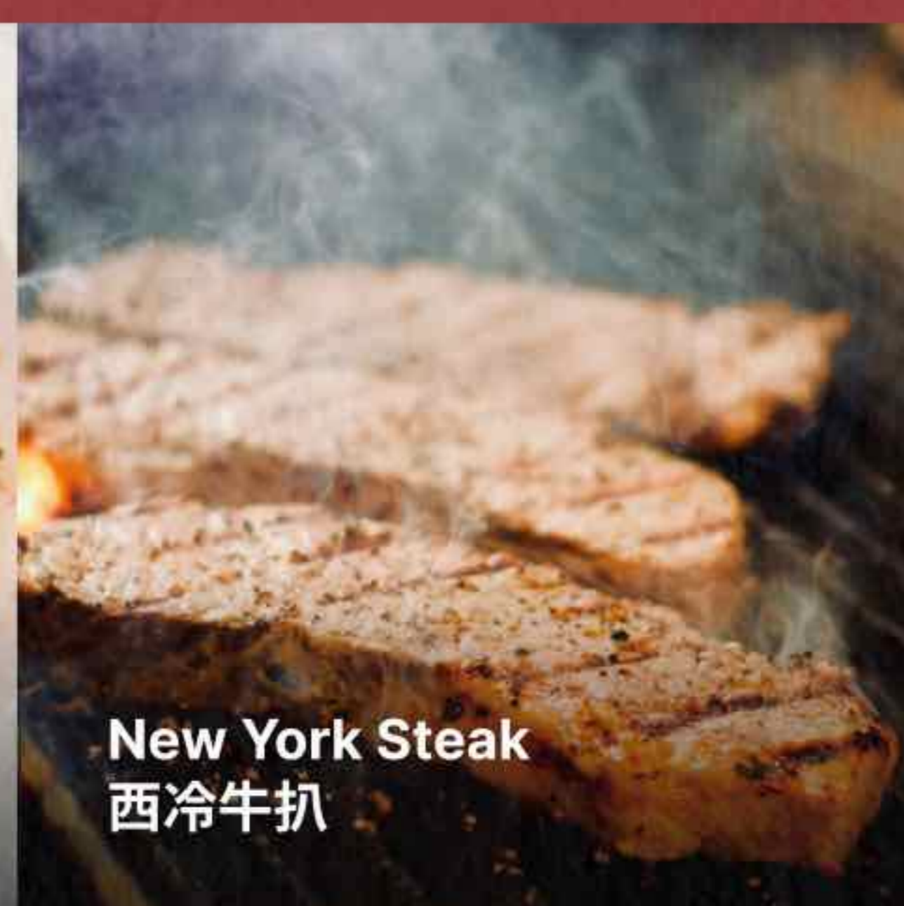
New York Steak 西冷牛扒